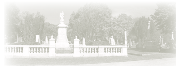
Stonington Cemetery Association