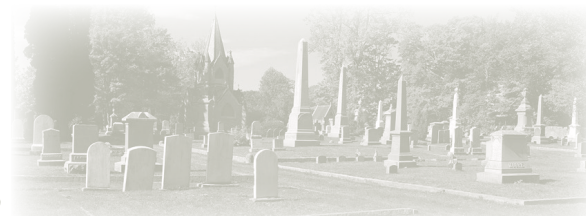
Volume 9 • Fall 2024